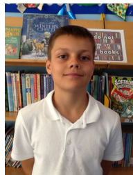
Hartley Year 6- Phoenixes

School Council meet regularly to discuss issues that are important to our children.